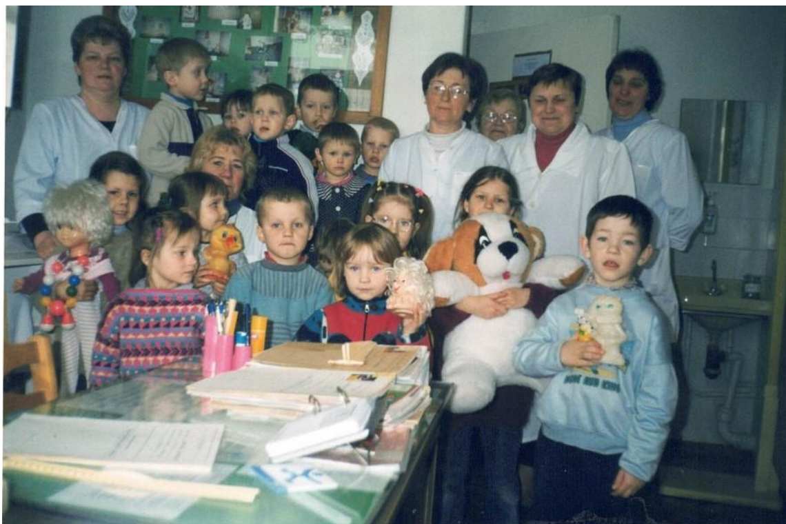
(The children visited Mosèdis Primary Health Center)