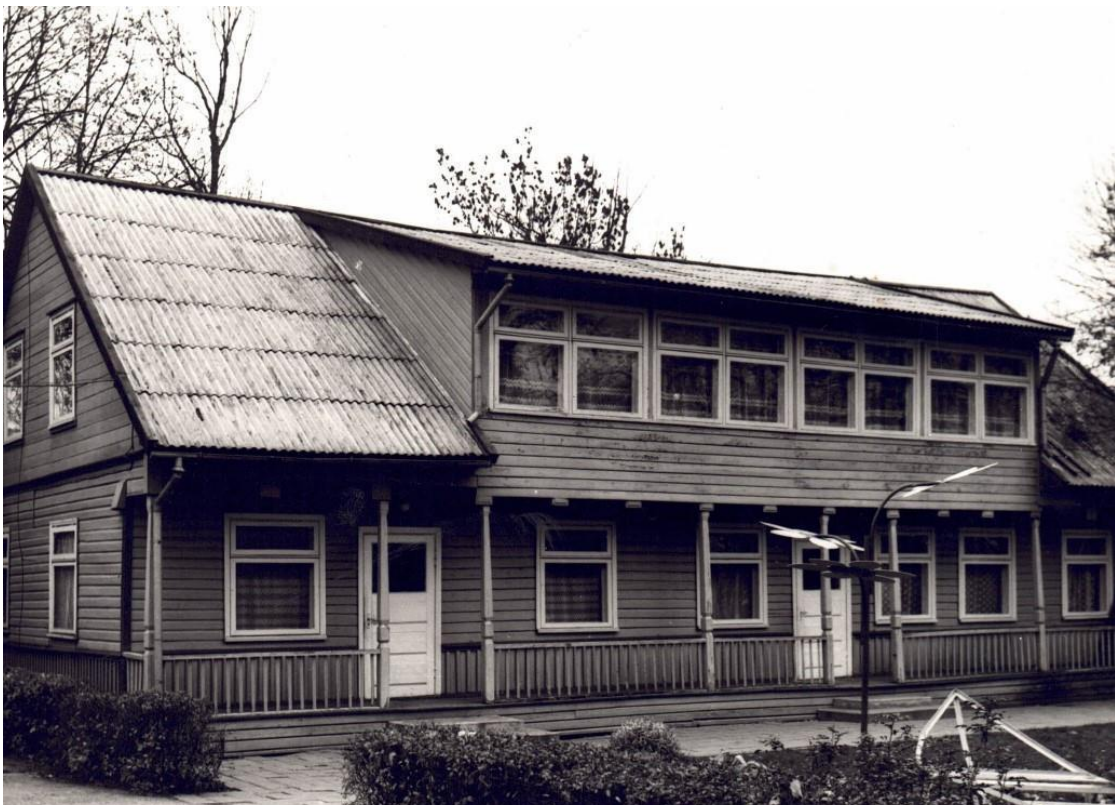
(In 1978, the collective farm gave a newly renovated building where the kindergarten group was located.)