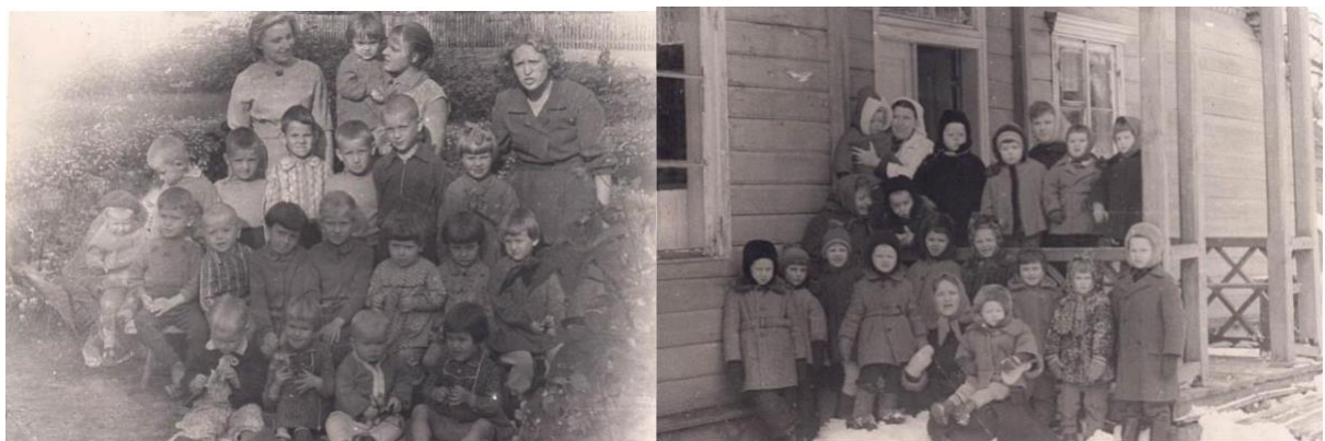
(The first collective of children and workers)