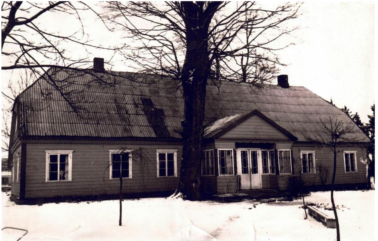
(The building where the kindergarten group started working on September 16, 1960)

Mosėdis nursery-kindergarten was founded on September 16, 1960. in the rectory premises. The first head of the kindergarten, L. Švitinienė, gathered a team of 4 employees who worked with 14 children.