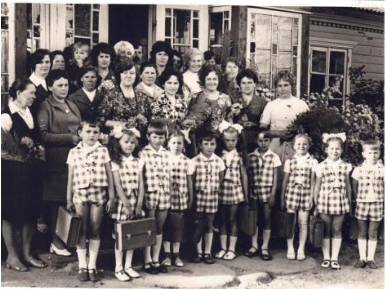
(A group of children and the staff on graduation day.)